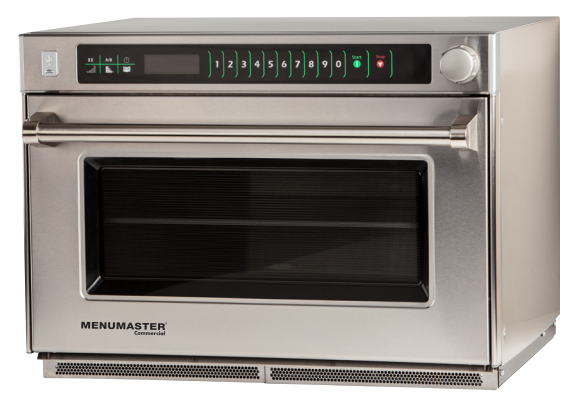
Model MSO5351 shown